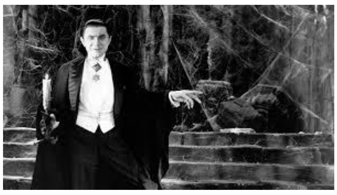
...and menacing the next!